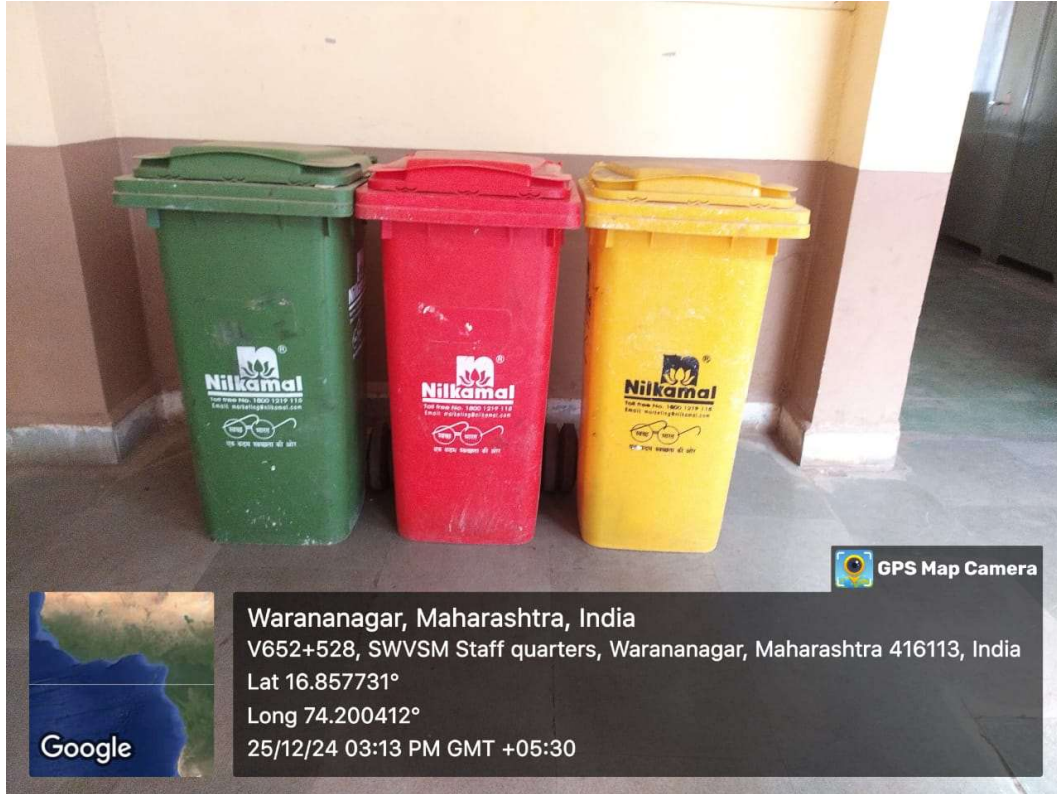
Solid waste management