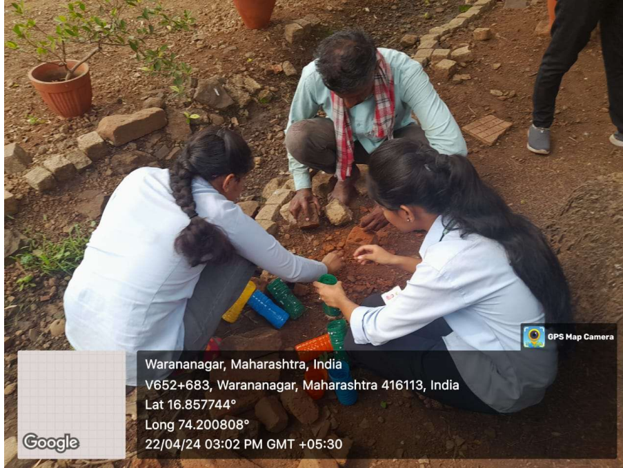
Celebration of international earth day (22/04/2024)